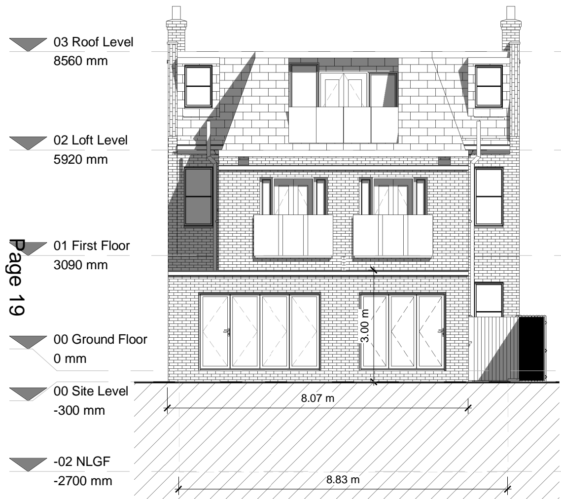
Proposed Rear Elevation. 1 : 100