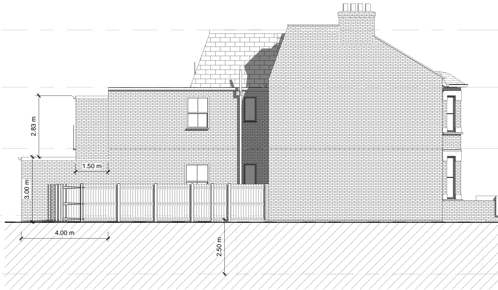
Proposed Side II Elevation. 1 : 100